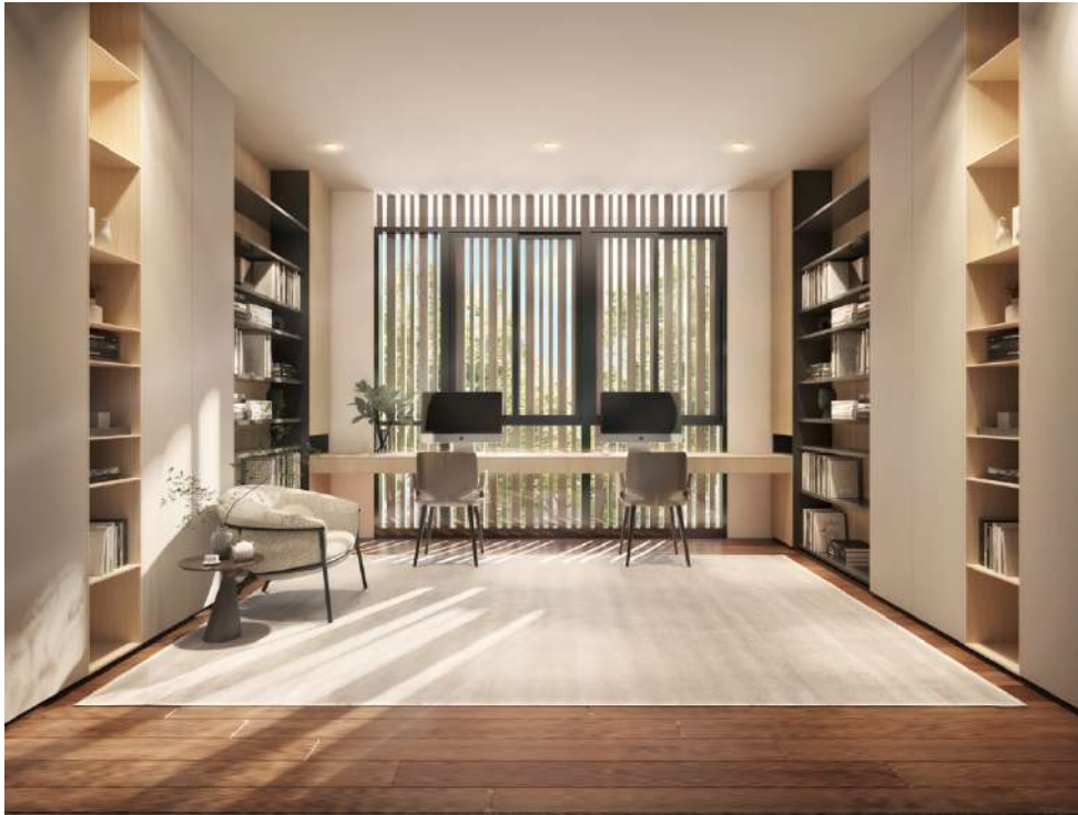
1. Study Zones @ 5 Jalan Isnin & 6 Jalan Sentosa & 6 Greenleaf Lane, naturally lit & ventilated, framed by greenery